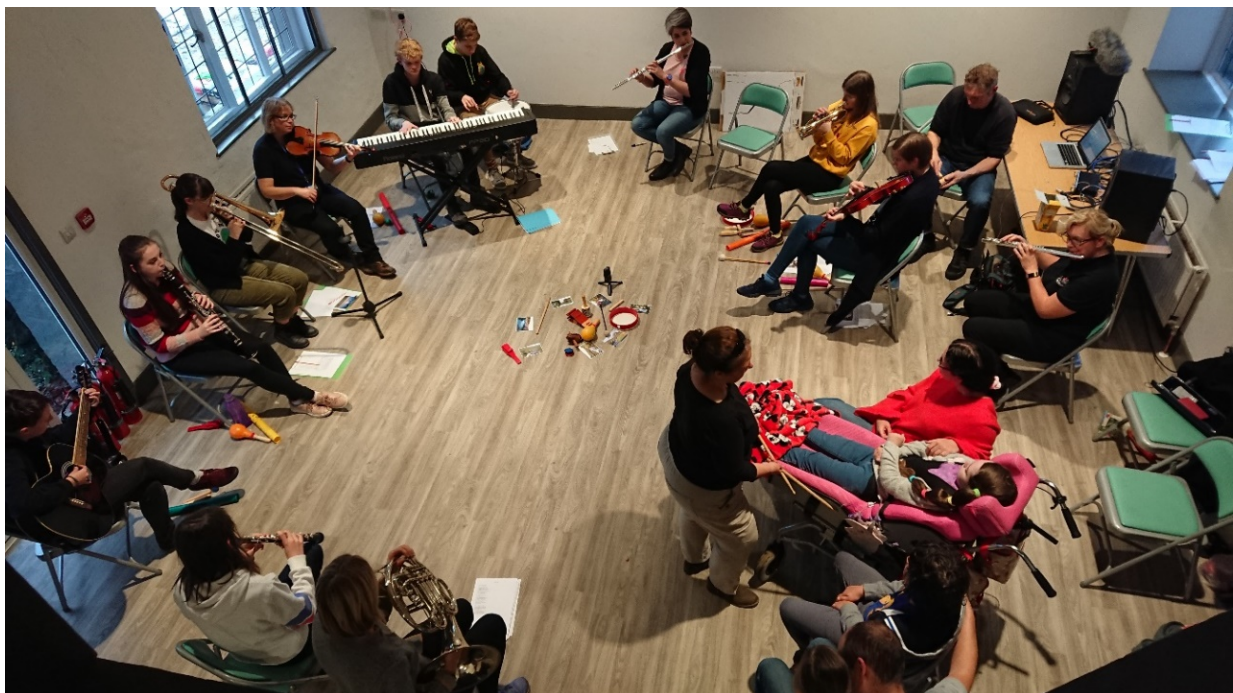
Inspiration Day at Wordsworth Grasmere

"I've learned to read some of the Sandgate students' physical responses.... Stillness is a good thing. Repetition is good."