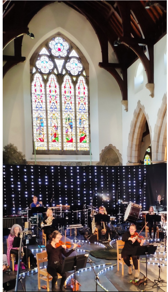
Manchester Camerata recording session, April 2021