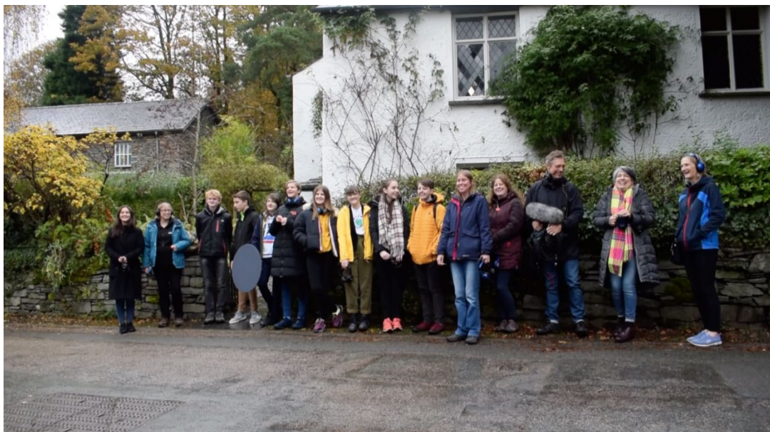
Young Composers and project partners at Dove Cottage, 2019

It was noticeable how respectful the YC and partners were of each other. The YC reflected that they definitely felt like equals, where their opinions were listened to and importantly, the work they completed on the composition was incorporated and developed into the final piece. In listening to the final piece during the Zoom sessions, it was clear to the YC where their composition elements were included.