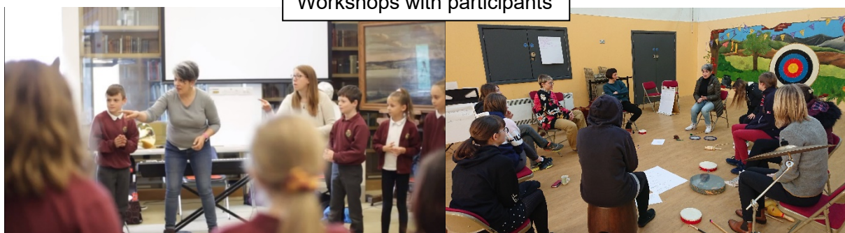
Workshops with participants